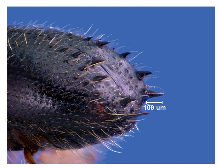
Figure 2. Declivity of Xyleborinus octiesdentatus adult female.

2008, ethanol-baited funnel trap (1); LOUISIANA, Winn Parish : Kisatchie National Forest, 6 miles w. of Winnfield, 24 April 2008, \alpha - \beta -pinene (70:30) and ethanolbaited funnel trap (1); 23 March 2009, \alpha - \beta -pinene (70:30) and ethanol-baited funnel trap (3), ethanol-baited funnel trap (3), phoebe oil-baited funnel trap (2); 9 April 2009, \alpha - \beta -pinene (70:30) and ethanol-baited funnel trap (1),: ethanol-baited funnel trap (2); 21 April 2009, \alpha - \beta -pinene (70:30) and ethanol-baited funnel trap (7), ethanol-baited funnel trap (4); 29 April 2009, \alpha - \beta -pinene (70:30) and ethanolbaited funnel trap (3), ethanol-baited funnel trap (6),: phoebe oil-baited funnel trap (2); 21 May 2009,: \alpha - \beta -pinene (70:30) and ethanol-baited funnel trap (2), trap on girdled yaupon (14); 9 June 2009,: trap on girdled yaupon (3); 15 June 2009, trap on girdled yaupon (3); 14 July 2009, trap on girdled yaupon (2); 4 August 2009,: trap on girdled yaupon (2). All specimens collected in North America are females.