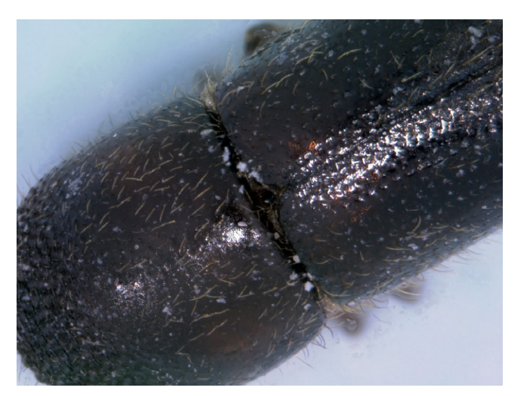
Figure 3. Scutellum of Xyleborinus octiesdentatus adult female.

yaupon whereas no specimens were collected from the other species. No specimens of X. octiesdentatus were found boring into the yaupon tree.